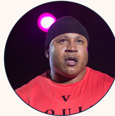
LL COOL J