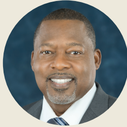
MAYOR RODNEY HARRIS